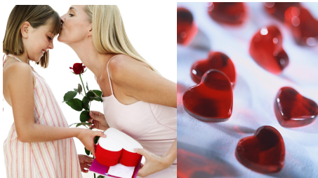
Happy Valentines Day 2008